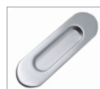
Oval Flush Pull (144S) satin, also available in black