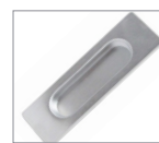
Rectangle Flush Pull (125/S) satin, also available in chrome