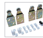
2 Door Fittings Kit (W02)