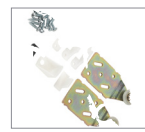
1 Door Fittings Kit (W01)