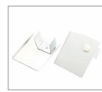
End Cap Pack (F134/ECP) for 134 Fascia