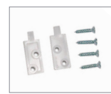
Guide (113/81X) for 81X channel, 2 per door

View our full range of accessories on page 136