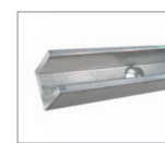
Guide Channel (81X) for when a guide channel is required